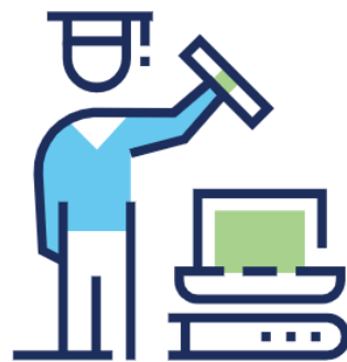
Recent Grad Membership